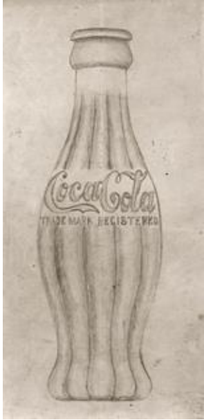
Earl R. Dean's original 1915 concept drawing of the contour Coca-Cola bottle