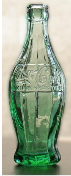
The prototype never made it to production since its middle diameter was larger than its base, making it unstable on conveyor belts.